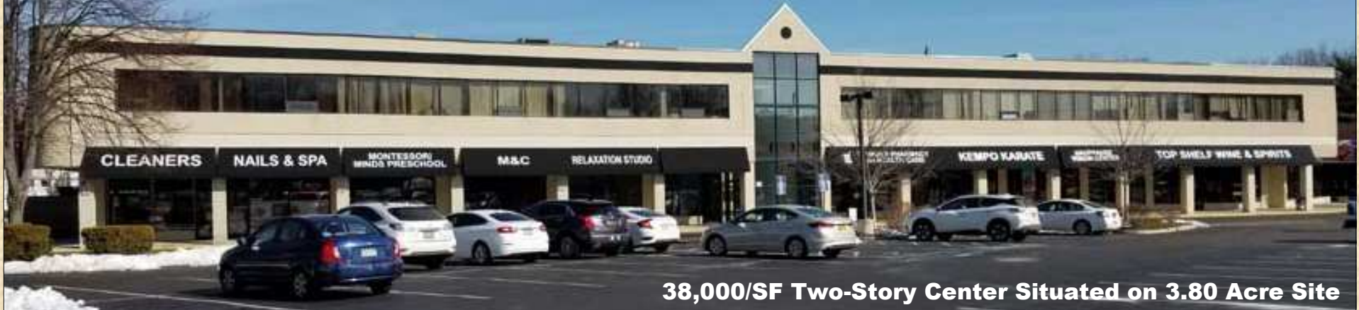
38,000/SF Two-Story Center Situated on 3.80 Acre Site

“Shopping Center Updated - Interior & Exterior Renovations Complete”